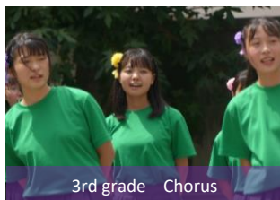
3rd grade Chorus