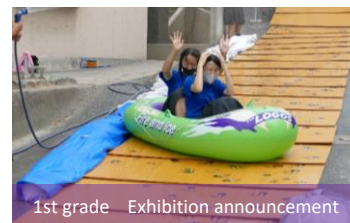
1st grade Exhibition announcement