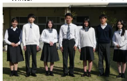
Flex : Spring & Autumn