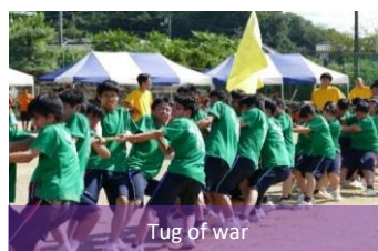
Tug of war