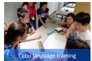
Cebu language training