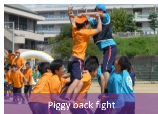
Piggy back fight