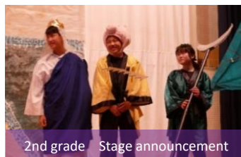
2nd grade Stage announcement